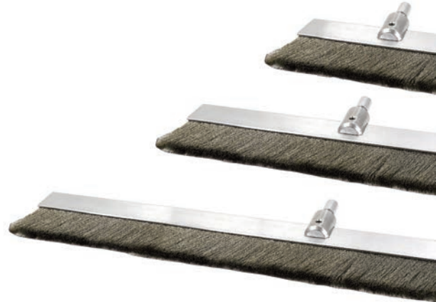
Flat Wire Brush Electrodes

Please Note: Each spring includes two pre-installed spring couplers. A spring connector (HHDCONNECT) is required to attach the PosiTest HHD to the spring couplers. Custom sizes and bulk pricing available. Additional couplers (HHDCOUPLER - 2 pack) are available.