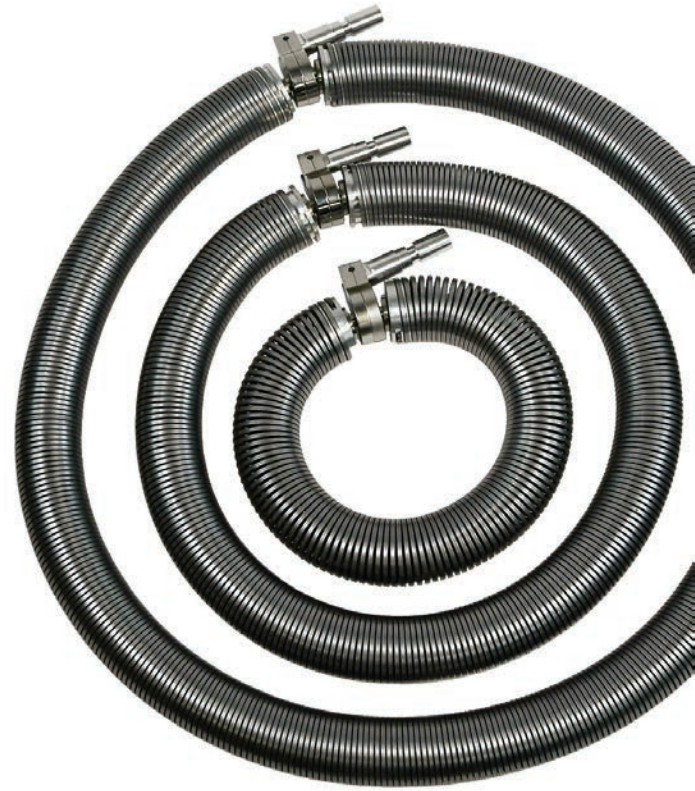
Rolling Spring Electrodes

For a complete list of available electrodes visit www.defelsko.com/hhd